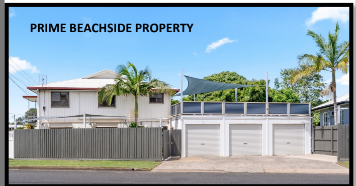
PRIME BEACHSIDE PROPERTY